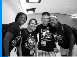
Strike A Pose!

This summer, Illinois sent their delegation to the 72 nd Annual NASC National Convention in Fort Worth, Texas. From June 25 th through the 28 th ,