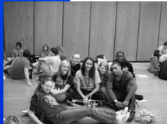
Small Group time