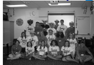
Illinois NASC Delegation

new friends and lessons. Be sure not to miss out on the fun experience and next year's convention in Colorado, "Leadership with an Altitude", June 27-