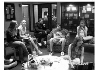
Club D in deep thought

board games. At night a variety of activities occurred including club Olympics and a talented variety show. When it came time to part at the conclusion of the closing banquet, many were disappointed to see it all end so soon. However, all the students left with a revived sense of leadership and strength and with new aspirations for their upcoming year.